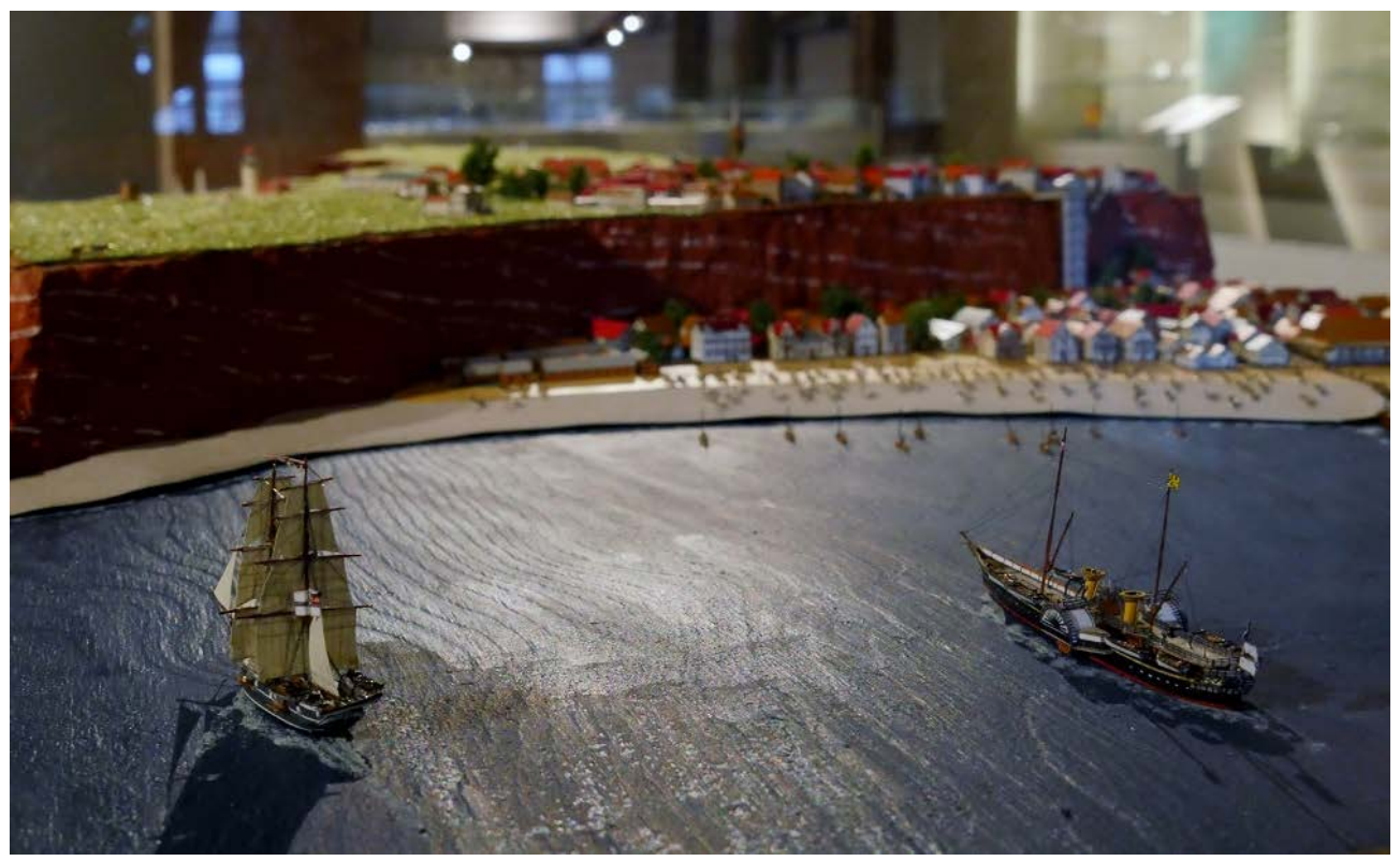
Heligoland 1890, a diorama in a scale of 1:1250 on deck 9.